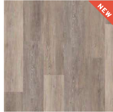
2065 Boathouse Oak Plank size: 184.2 x 1219.2mm