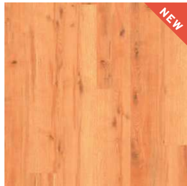
2068 Sherwood Oak Plank size: 184.2 x 1219.2mm