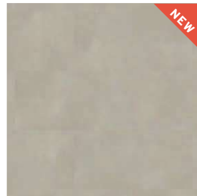
2082 Pearl Stone Tile size: 304.8 x 609.6mm

This design intentionally features a strong pattern and/or colour variation to accurately replicate natural timber.