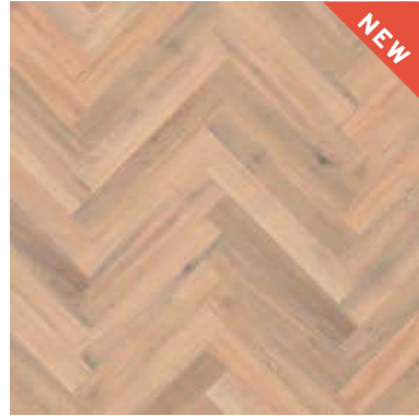
2063 Naked Blond Oak Parquet Parquet size: 76.2 x 457.2mm