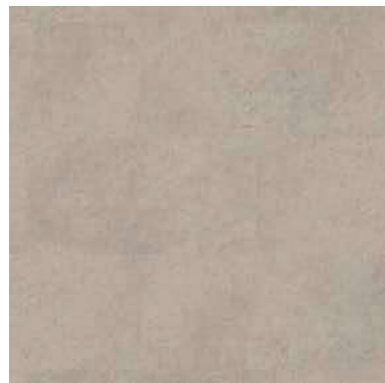
2103 Light Grey Concrete Tile size: 304.8 x 609.6mm