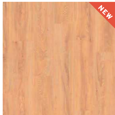
2067 Sienna Oak Plank size: 184.2 x 1219.2mm