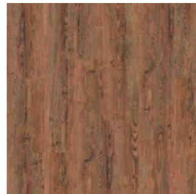
2108 Huckleberry Oak Plank size: 184.2 x 1219.2mm