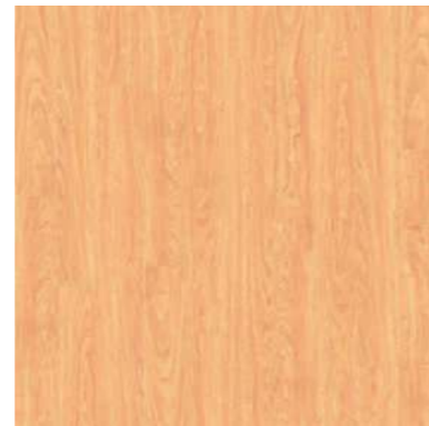
2041 American Oak Plank size: 101.6 x 914.4mm