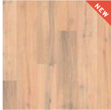
2066 Naked Blond Oak Plank size: 184.2 x 1219.2mm