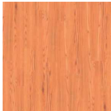
2042 Oak Plank size: 101.6 x 914.4mm