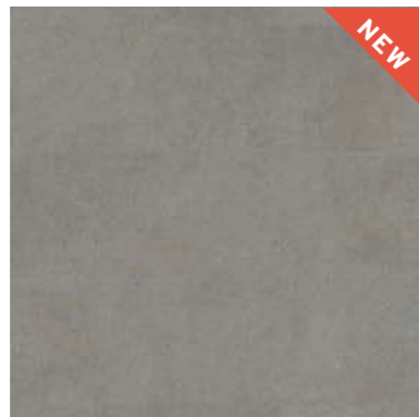
2081 Cool Grey Concrete Tile size: 304.8 x 609.6mm