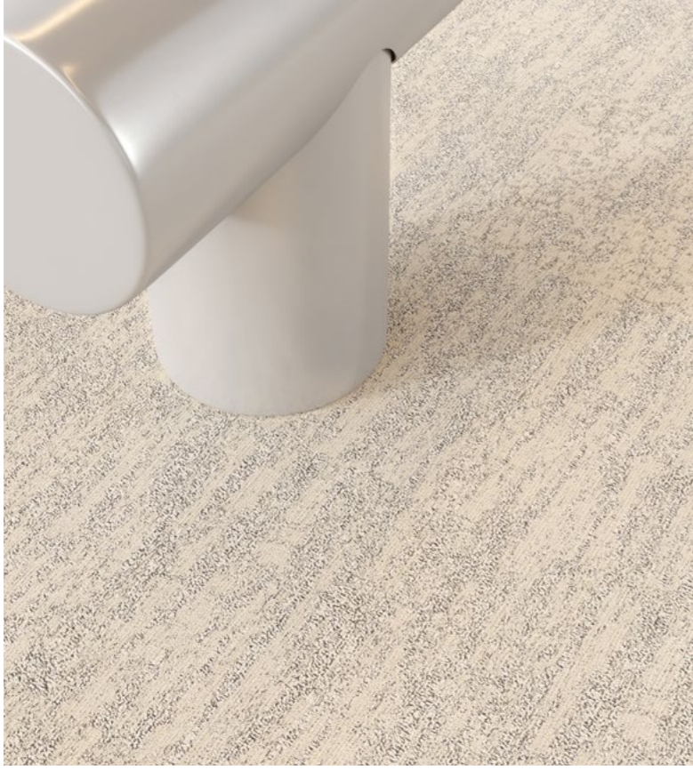
WILLOW 180, LEAF 180