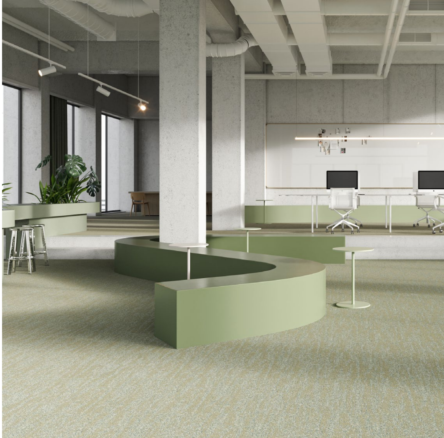
GRIND 639, WILLOW 639